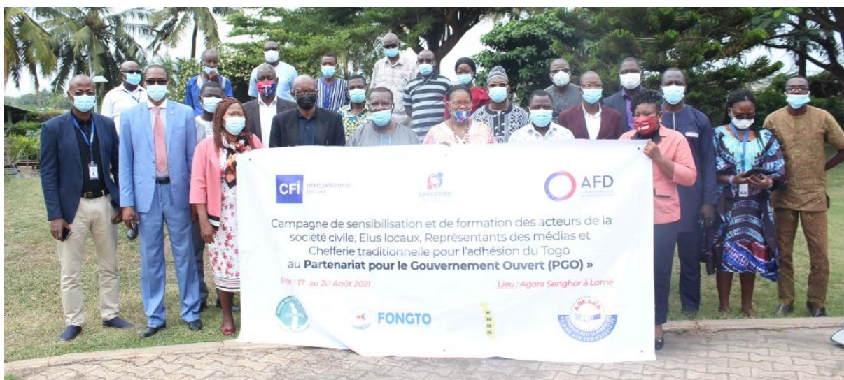
Figure 21: Advocacy Training Workshop for Togo's Accession to OGP