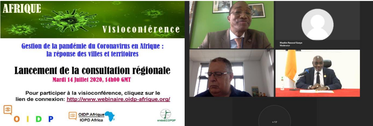
Figure 8: COVID Consultations Launch Session – IOPD Africa

Thanks to this approach, representatives of 18 African countries exchanged during webinars on the context of the outbreak of the pandemic in their respective countries, its evolution and the measures that have been taken by the central government and local governments. These countries also shared the impacts of the pandemic (on the local economy, democracy, citizen participation, etc.), and tried to identify avenues for response and resilience in order to better prepare for the post-COVID period. In terms of audience, 369 participants from 31 African countries and around the world were able to take part and contribute to the discussions on all the consultations. For each sub-region, the consultations were chaired by the President of the IOPD and moderated by the Africa Coordinator of the IOPD. These consultations saw the participation of local authorities, officials of the IOPD and various partner institutions, in order to share their experiences of the management of the pandemic at the level of the territories, in their respective countries.