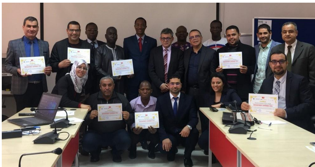
Figure 16: LED training family photo - Tunisia

It was organized by Enda ECOPOP in partnership with the Training and Support Center for Decentralization (CFAD of Tunisia), the Academy of Local Authorities of United Cities and Local Governments of Africa (ALGA/UCLG Africa), the International Observatory of Participatory Democracy (IOPD Spain) and with the scientific support of UN HABITAT and ECOPLAN (Canada) who produced the didactic materials for the training.