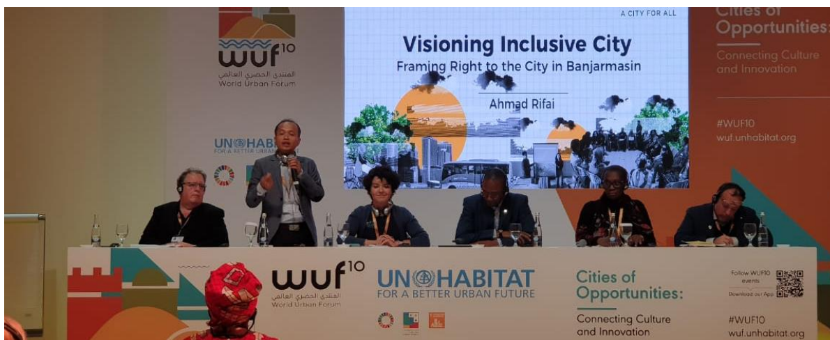
Figure 7: Session on Participatory practices and the right to the city at the heart of urban innovation