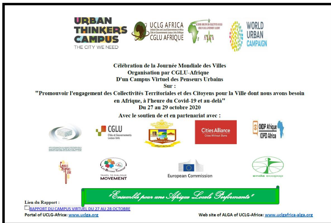
Figure 9: Virtual Campus Flyer

including: UNDESA, UN-Habitat, Cities Alliance, UNESCO, ICESCO, the City of Rabat, the Regional Council of Tourism of the Region of Rabat-Salé Kénitra, Romulado Del Bianco Foundation, Life Beyond Tourism of Florence. The Day of Action was dedicated to Culture and Heritage in the context of the Covid-19 pandemic, in coordination with the African Capitals of Culture (ACC) Program of UCLG-Africa and the City of Rabat .