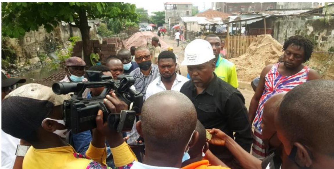
Picture 5: Press Briefing by Guillaume Ilunga, Mayor of Barumbu – DR Congo

For this year, the priorities of the municipality of Barumbu were related to the Hygiene component and have been taken into account. In terms of achievements, four (4) public toilets have been set up, of which three (3) are still under construction and one is already operational. The rate of completion of the works is thus 55%, the cleaning of the rivers not having yet been taken into account.