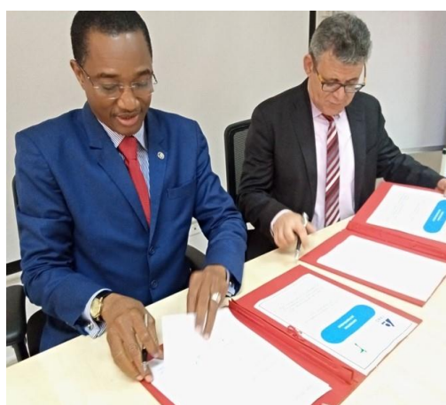
Picture 17: Signature of the partnership agreement between CFAD and enda ECOPOP

The closing session was an opportunity for the Executive Coordinator of Enda ECOPOP and the Director General of CFAD to proceed with the signing of the partnership agreement, allowing the two institutions to combine their efforts to strengthen the support capacities of decentralization in the areas of training and networking on various themes related to decentralization, governance, local development and the domestication of the SDGs.