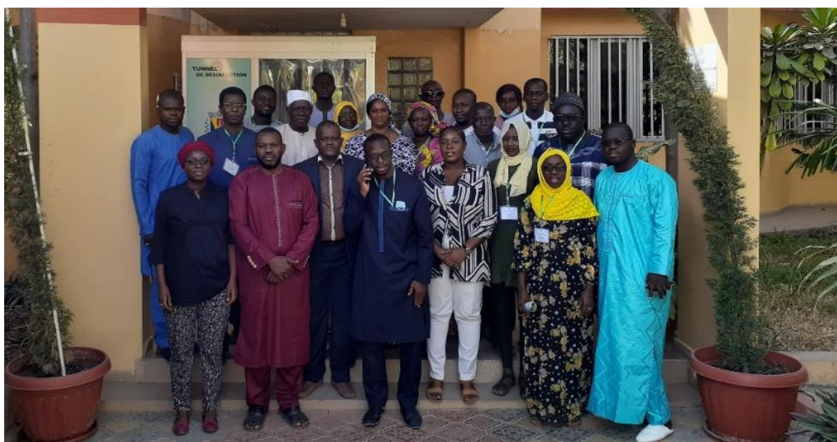
Picture 19: Training of technical agents and local actors in the city of Dakar and the municipality of Grand-Yoff

The objectives of holding these training sessions were to: