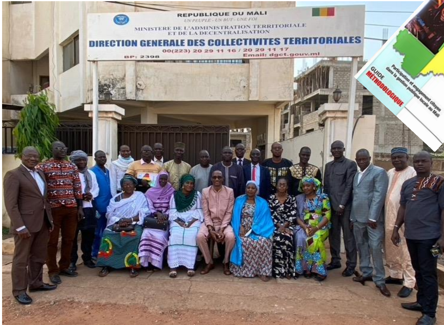
Training of facilitators on the guide for citizen participation and engagement in local public management in Mali